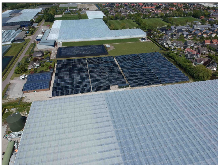
A 6.5 MW th collector field heats a greenhouse in Heerhugowaard, the Netherlands, since 2019.

Two new applications in this sector worth highlighting are solar heated greenhouses , which include systems ranging from 126 m 2 collector area to just over 14,000 m 2 , and solar heated gas pressure control systems , which use solar to heat natural gas at gas pressure regulation stations during pipeline transportation, an interesting niche application being used in several systems in Germany.