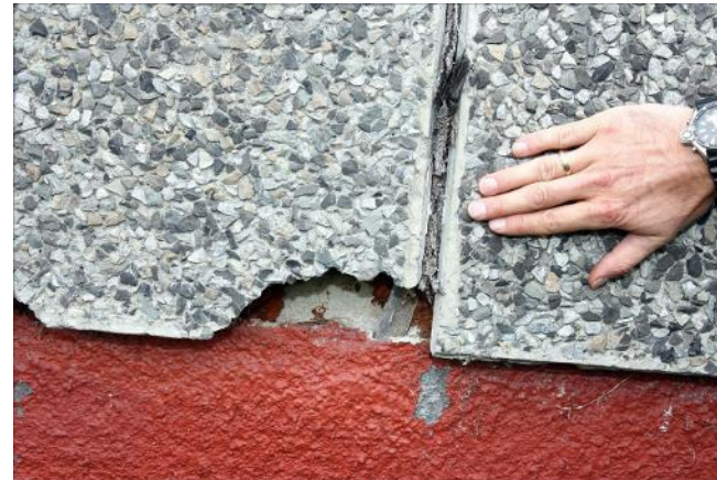
Damage to the facade