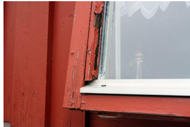
Windows in poor condition-