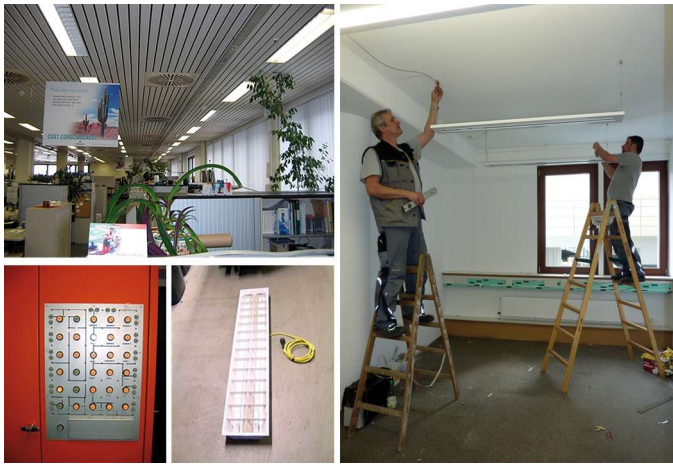
Outdated lighting solutions and retrofit in action