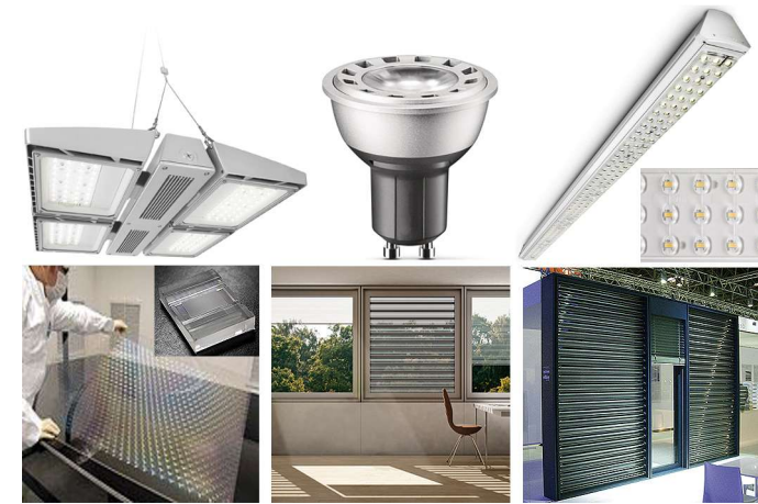
New systems of lamps/luminaires and façades for retrofitting