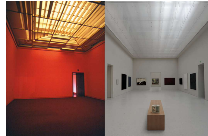
The "New Gallery" (Kassel, Germany) before and after refurbishment

Daylighting Electric Lighting Lighting Controls