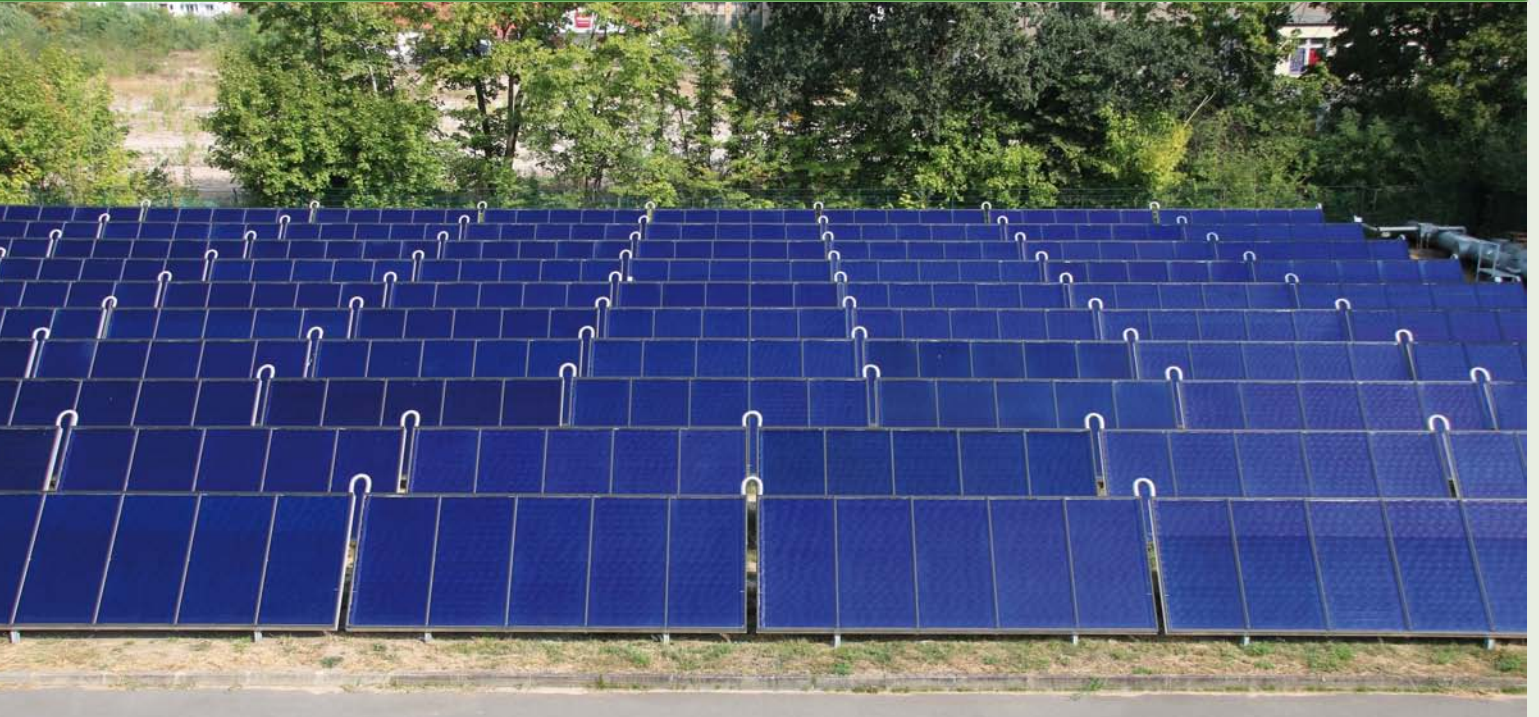
A 0.7 MW th solar thermal system supplies heat to the Berlin district heating network.